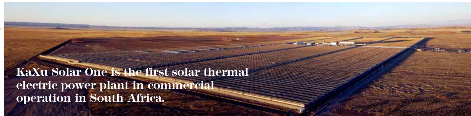
KaXu Solar One is the first solar thermal electric power plant in commercial operation in South Africa.

80 000 homes will receive power from this project