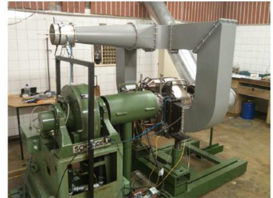
Front right view