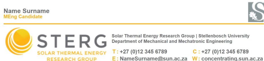
Figure 2: The STERG email signature

STERG has its own e-mail signature which members may use if they wish to represent STERG. A default signature is shown in Figure 2.